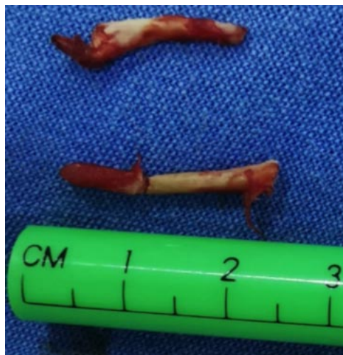
Fig. 3. Elimination of right and left styloid processes.